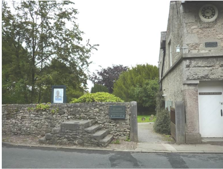
Figure 3. The entrance to the burial ground showing the mounting block and part of the former school building.