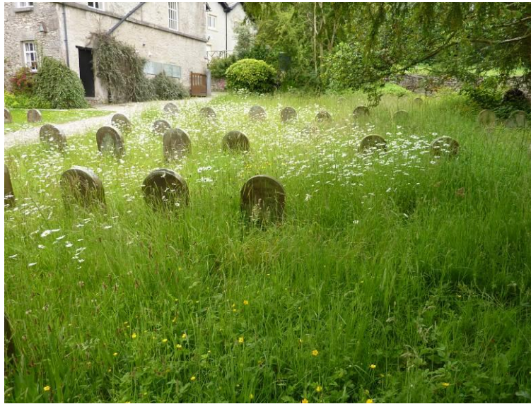
Figure 2. The burial ground